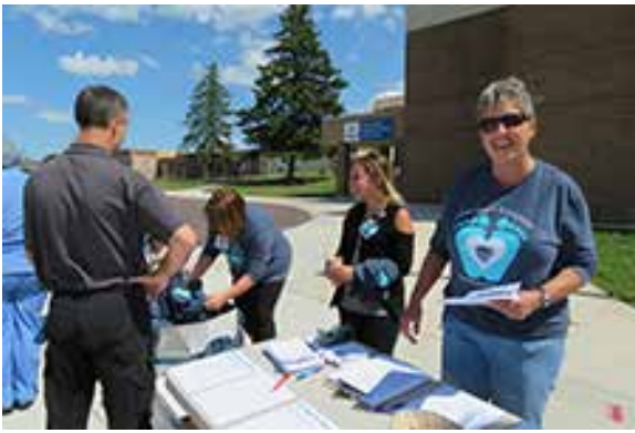
Team Wayfinders Prize Drawing Party