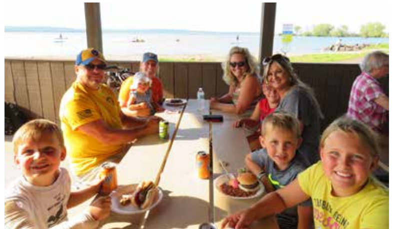
Wellness Team Employee Potluck. More potluck photos are up on the intranet.